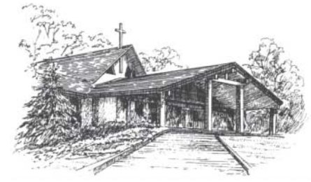
St. Lucy Mission P.O. Box 98 Middlefield, Ohio 44062 16280 Kinsman Rd.