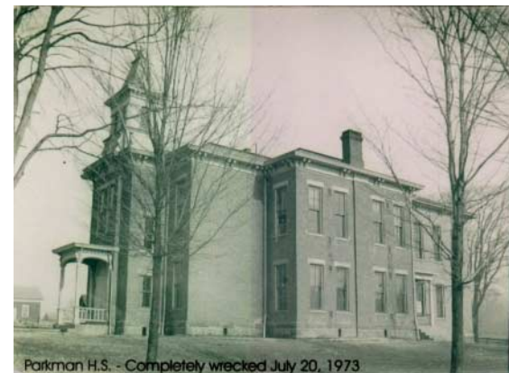
Parkman H.S. - Completely wrecked July 20, 1973