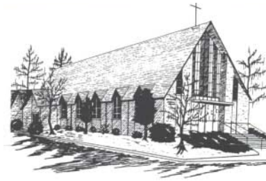
St. Edward Church P.O. Box 709 Parkman, Ohio 44080 16150 Center St.

Please feel welcomed to send any local Amish thoughts to the Parkman Paragraphs!