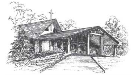
St. Lucy Mission P.O. Box 98 Middlefield, Ohio 44062 16280 Kinsman Rd.