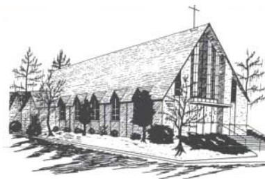
St. Edward Church P.O. Box 709 Parkman, Ohio 44080 16150 Center St.