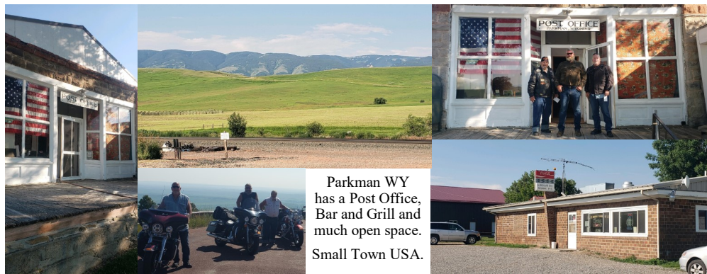
Parkman WY has a Post Office, Bar and Grill and much open space. Small Town USA.