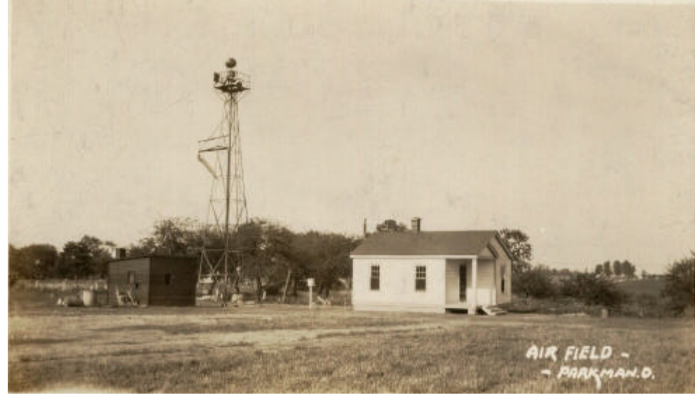
Parkman Ohio - Geauga Counties first Air Mail flight August 3rd, 1929 at the Parkman Air Field